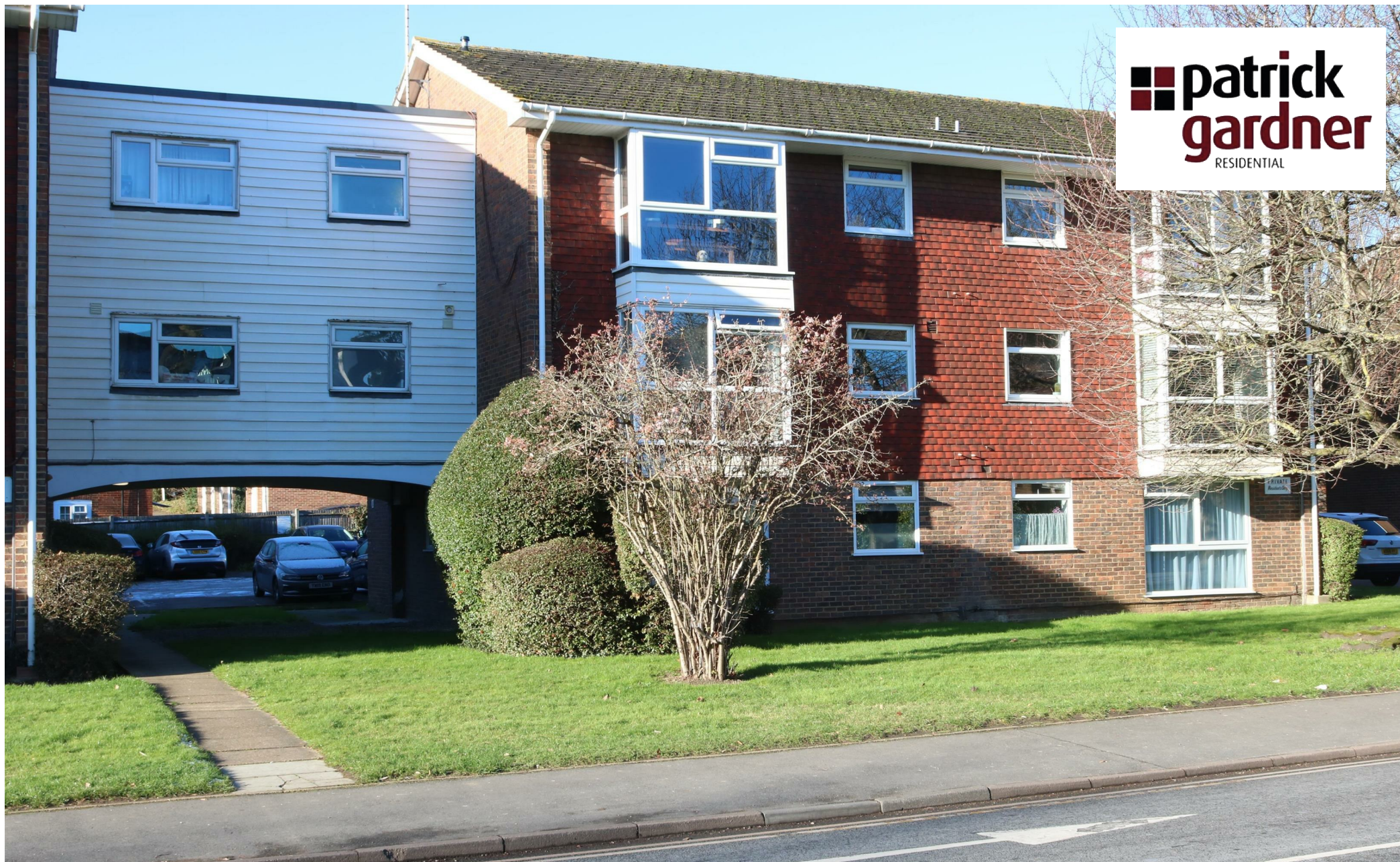
8 Copperfield Court, Leatherhead, KT22 7LD